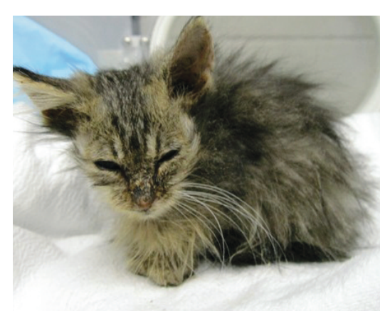
Figure 2 Generalized dermatophytosis in a kitten with malnutrition, diarrhea and upper respiratory infection

Simple infection This group consists of cats or kittens with confirmed infections that are otherwise healthy and not under physiological stress. Lesions are obvious but limited in extent. Provided the cats/kittens remain healthy, and not stressed, and receive appropriate preventive care, they will respond well to therapy (Figure 1).