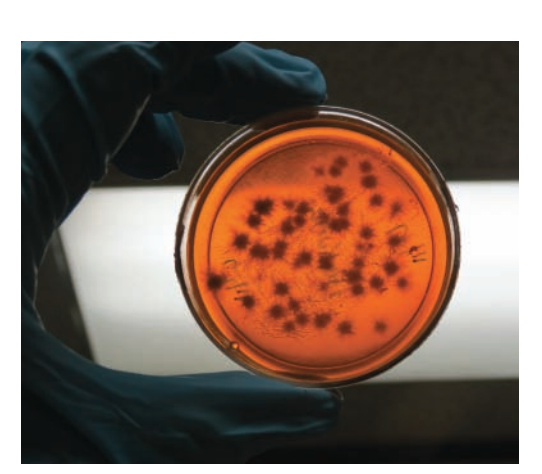
Figure 9 The best way to examine cultures daily is to hold them up to the light to look for evidence of growth. It is not necessary to open plates except to obtain samples

There is unfortunately no simple answer to the question 'what is the best treatment protocol?', because it depends on the number of cats involved, the owner's/shelter's resources, and the global health of the cat(s). When discussing treatment options with people, the author uses the 'CCATS plan' as a reminder of the essential components (confinement, cleaning, assessment, topical therapy and systemic therapy). Informed consent requires explaining that this is a selflimiting disease and will resolve in otherwise