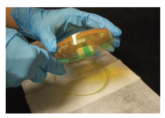
Figure 7 Inoculating plates 'upside down' over a disinfectant wipe minimizes contamination

Several different methods have been described for obtaining samples (eg, use of toothbrushes, carpet squares and gauze or commercial dust cloths).<sup>20,31,32</sup> In the United States, the most common method is to collect samples using a toothbrush and then gently stab the bristles on to the surface of a fungal culture plate. (Large quantities of individually packaged sterile toothbrushes can be purchased online from overstock stores or hotel suppliers.) Toothbrushes are preferred because early infected hairs are