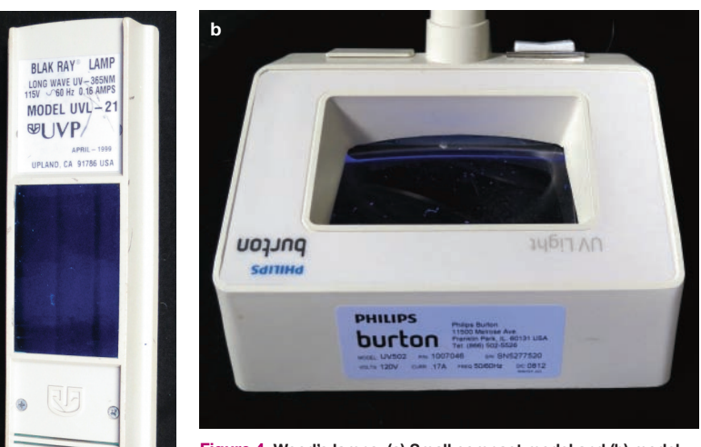
Figure 4 Wood's lamps. (a) Small compact model and (b) model with built-in magnification

from infected cats were examined for the presence of fluorescing hairs in the bristles. The author and a trained lay person examined the toothbrushes with the small hand-held unit, with no time constraints and a slide with fluorescing hairs as a control. When the same toothbrushes were re-examined using magni-