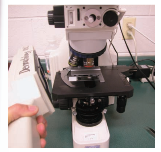
Figure 5 Using a Wood's lamp to locate hairs for microscopic examination

Infected hairs can be readily identified at x4 or x10 magnification, appearing pale, wide and filamentous compared with normal hairs (Figure 6). On high magnification (x40) cuffs of arthrospores are visible. M canis is an ectothrix infection and careful examination will reveal large cuffs of spores on the surface of hairs before the hair shaft is invaded by the organism.