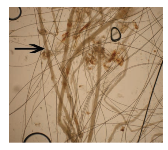
Figure 6 Microscopy of Wood's lamp positive hairs mounted in mineral oil. Infected hairs are wider and paler than normal hairs (arrow). x10 magnification