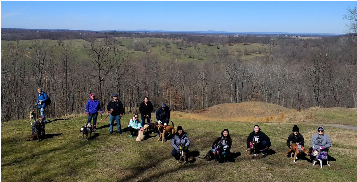
Figure 2: ResQ Crew by NOVA Pets Alive is a volunteer-run walking group. Shelter fosters often bring their foster dogs on the walks for added socialization and to learn more about them.

informal style. Shelters can schedule offsite walks for volunteers, and volunteers can be trained to lead them. Informal groups outside the shelter can create dog walking groups as well.