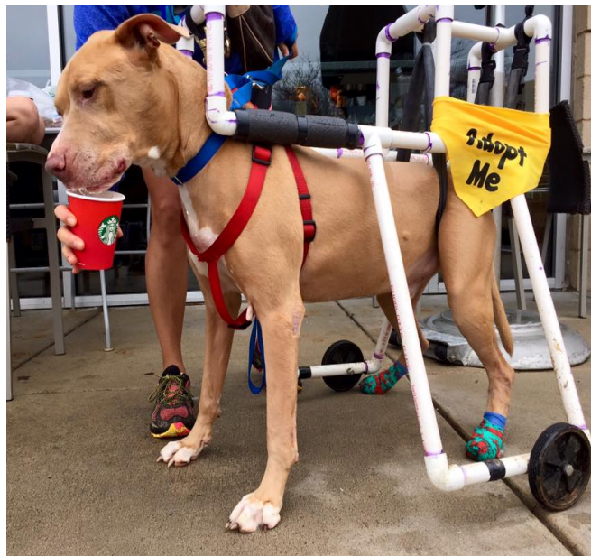
Figure 1: Volunteers knew that getting a 'puppachino' was French Fry's favorite way to end an outing

The shelter has several trained volunteers who assist with the power hour program. These volunteers arrive at the shelter before the power hours begin, assist in matching fosters with dogs, help fosters gather needed supplies, and check power hour fosters in and out via the shelter's software, saving the foster coordinator's time.