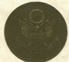
Tom Reed, Member of Congress NY-23

CONGRATULATIONS ON RECEIVING THE 2021 AVANZINO LEADERSHIP AWARD!