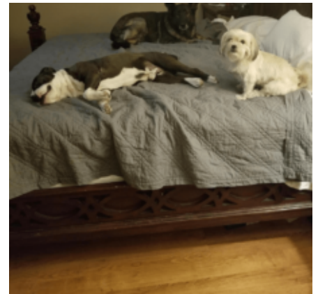
Walter relaxing on his foster parent's bed with his two foster "sisters"

Chester was a 4-year-old male pit bull-type mix who was also transported to our facility from an animal services agency. Upon arrival, Chester presented with several stress-induced behaviors including barrier aggression and sensitivity to handling. He would