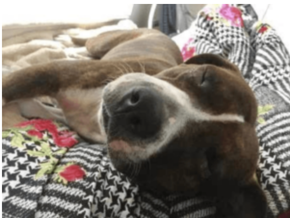
Chester sleeping on his foster parent's bed

often present as catatonic due to his discomfort. In addition to his behavioral hurdles, both of Chester's eyes required extensive medical attention. We conducted onsite playgroups at the shelter, which helped him, though nothing launched Chester's behavioral progress as quickly as his Weekend