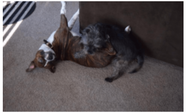
Chester playing with a small dog in the foster home

h easy-to-implement strategies, a Weekend Getaway program can be launched at your animal shelter, animal services agency, or rescue. I hope this article allowed you to draw some inspiration for what will benefit your own foster program. The Walters and Chesters of the world will thank you!